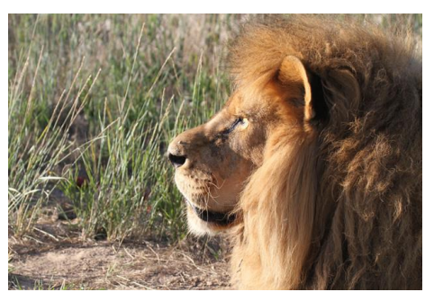
WILD ANIMAL SANCTUARY - KEENESBURG, CO. (Aiming for:) Thursday May 4th, 2023 (Alternate date in case of bad weather:) Monday May15th

You will purchase your ticket at the Welcome Center the day of the event.